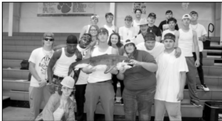
The Kru's Creed: BullshARK.